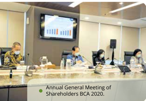
● Annual General Meeting of Shareholders BCA 2020.

BCA publishes its Sustainability Report annually, separately from its Annual Report, however the contents of these two reports are complementary. This report is a continuation of the 2019 Sustainability Report, which was published on March 11, 2020. This report contains the sustainability performance for the period January 1 - December 31, 2020, and includes comparisons with the previous two years’ data in important performance sections.