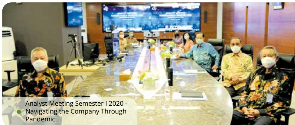
● Analyst Meeting Semester I 2020 - Navigating the Company Through Pandemic.